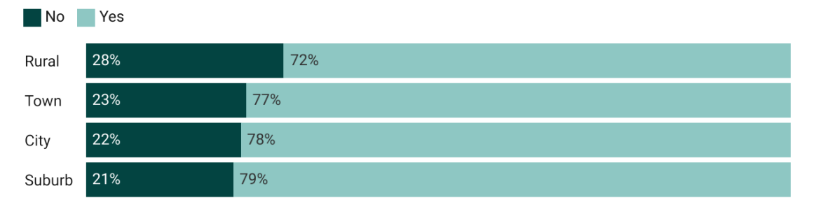
Figure 2. Do You Receive Help from Your Parents to Pay for Housing, Tuition, or Other College Expenses?