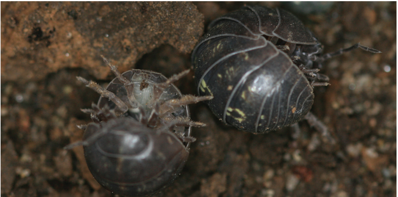
Figure 3. Pill bugs are also known as roly-polies for their ability to roll up into a tight ball. Sow bugs cannot curl their bodies into a ball.

Several generations develop each year. Females brood their eggs under their bodies for several weeks within a water-filled sac called the marsupium . Immatures initially stay inside the pouch for a few weeks after hatching but then disperse, developing through ten or more molts before reaching adulthood.