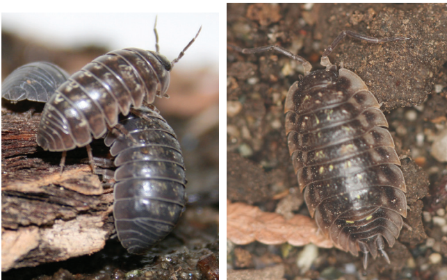
Figure 2. Pill bugs (left) and sow bugs (right) look similar to each other but comprise seven different species in Idaho.

Both have seven pairs of short, jointed walking legs and one pair of short but stout, jointed antennae at the head. They have a pair of weak jaws that are mainly used to feed on decaying vegetation, but sometimes they also feed on tender living garden seedlings. They usually feed at night and hide by day.