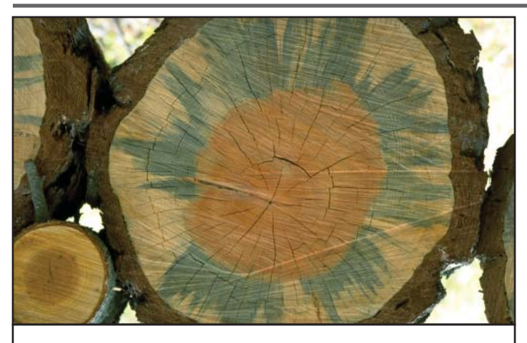
Blue stain fungus is one of the first signs of degradtion in log quality.

Fungi require certain levels of temperature, moisture, and oxygen to become established and thrive. When the moisture content of wood falls below 15 percent, fungi become inactive. Some species of fungi do not die at this point, but go dormant and become active again when conditions become favorable. Excessive moisture decreases oxygen supplies, and when wood is completely saturated, oxygen levels are not sufficient to sustain fungal growth. On dry sites, deterioration often occurs on the lower bole where moisture conditions are more favorable. On wet sites, moisture conditions will be more favorable higher up in the stem.