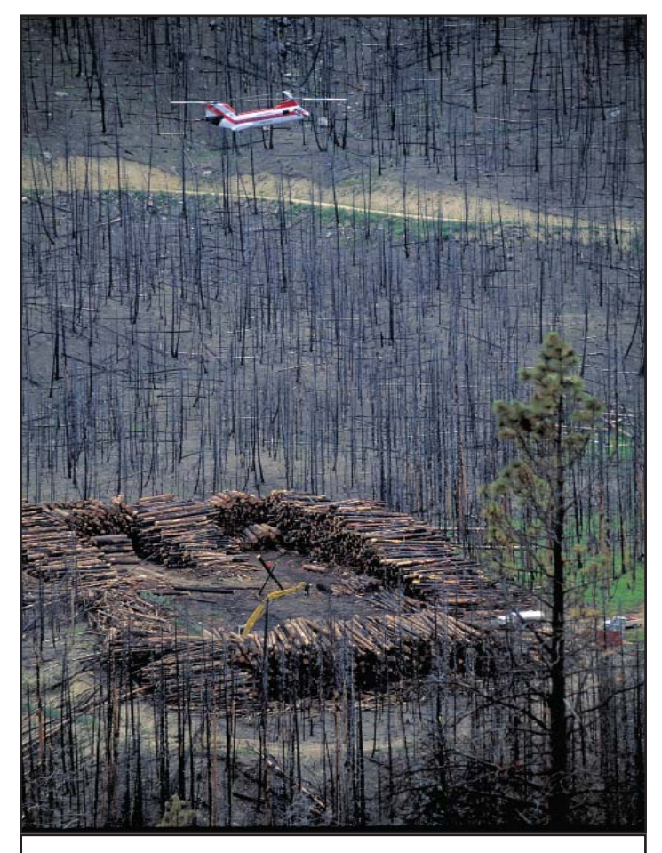
Salvage cuts should be done ASAP after a burn - by year three much or all of the value has been lost.

Salvage cuts are often initiated after a disturbance (fire, wind, insect or disease kill) to recover the value of damaged trees and remove hazard trees. Salvage operations are usually not done unless the material taken out will at least pay the expense of