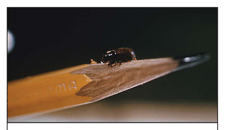
Nothing loves a stressed tree more than a bark beetle – unless it's thousands and thousands of bark beetles.

Second, fires must occur at a time of year when beetles are in the adult stage and can quickly infest susceptible trees. And third, because bark beetles are not very strong flyers, there must be a population of beetles within a reasonable distance to take advantage of weakened trees that become available.