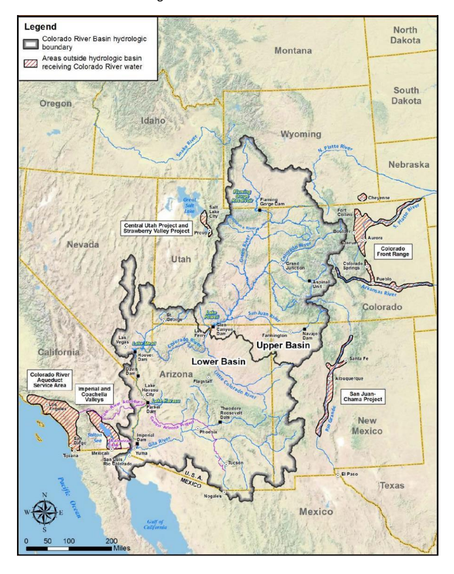
Figure 1. Colorado River Basin<sup>38</sup>